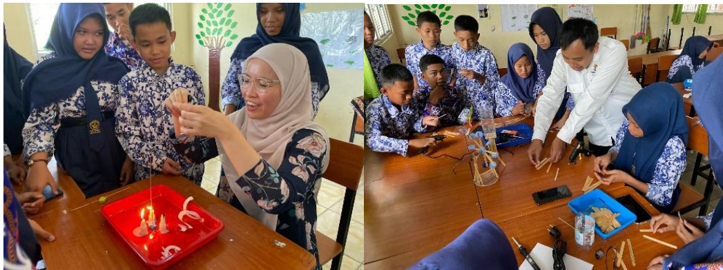
Figure 2. Delivery of “Spinning Murukku” material

Previous research has shown that STEM-PjBL significantly improves students' scientific communication and problem-solving skills in alternative energy (Maspuh, 2024; Delima et al., 2023). Previous research has provided empirical evidence that collaborative activities, such as creating renewable energy-based learning media, not only foster students' creativity but also strengthen their energy literacy, both in terms of conceptual understanding and communicative and collaborative competencies (Patriot et al., 2023; Bulu & Tanggur, 2021). The delivery of “Spinning Murukku” material is shown in Figure 2.