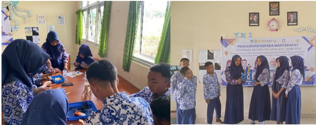
Figure 3. Tool-making practice and group presentation

The practice of making tools and group presentations is shown in Figure 3.