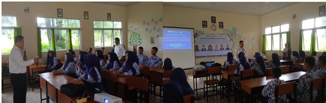
Figure 1. Presentation of material by the resource person

Students actively engaged in a question-and-answer discussion with the resource person regarding renewable energy and its use in STEM-based learning media. The renewable energy implemented in this community service activity included solar power plants (PLTS), hydroelectric power plants (PLTA), and wind power plants (PLTB). The resource person also presented examples of simple STEM-based Renewable Energy learning media. The resource person's presentation of the material is shown in Figure 1.